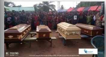
Thousands turned out to pay respect to the families at the funeral