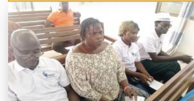
Duamenefa Keta Community Leaders