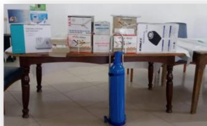
Hospital Donations April 2023

Given to the Children's Ward were the following items: suction machine, a large handheld pulse oximeter, 10L oxygen cylinder with regulator, glucose monitoring system with strips, a fetal doppler, and a