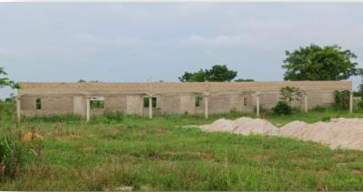
The classroom block