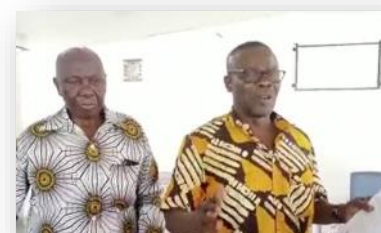
Reverend Ministers lead in prayer

The male ward received an adult scale and four ceiling fans.