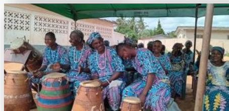
Drumming group enjoying a good laugh