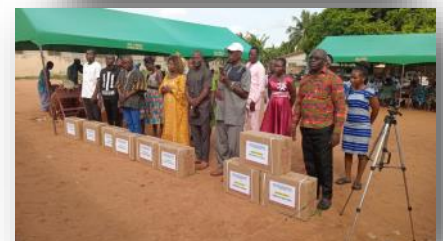
Single parents receiving a new sewing machine