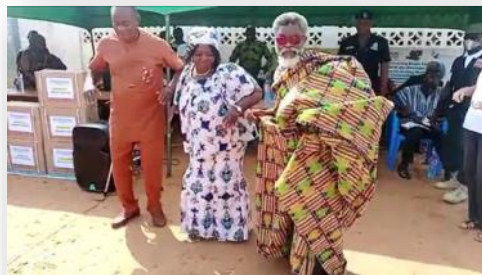
MCE & Exec. President dance with mother of top student