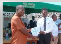
Awards given to students or parents