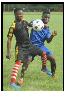
Scenes from the 2019 Duamenefa Regional Tournament