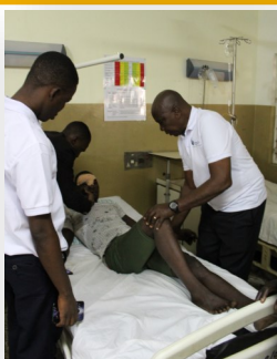
Prayer, food, patients, staff and families were part of the Duamenefa Foundation care for sick.