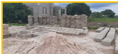
Stacks of blocks numbering over 5,000