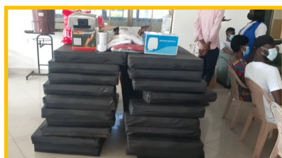
Donated Items for Keta Municipal Hospital