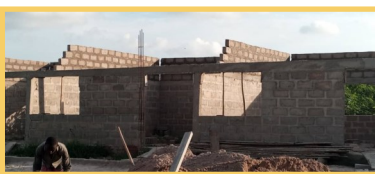
Classroom walls going to the roof