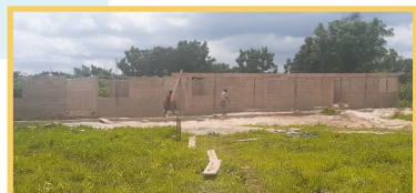
Classroom lintels being formed/poured

Big steps must be taken to get the school ready for the students and staff (some of who will reside on the school premises) to help with the spiritual process of healing.