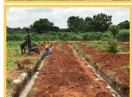
Classroom foundation work