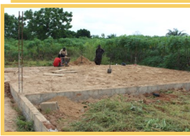
Filling to top of foundation