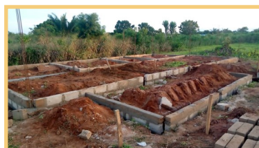
Bungalow foundation work

Interviewing of the applicants will take place in the next few months in anticipation of a September 2022 opening.