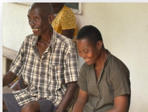
Widows and disabled in Blekusu And homebound / blind