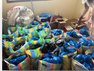
Preparing the bundles

It was a most beautiful sight to see the praise and worship and thanksgiving to God.