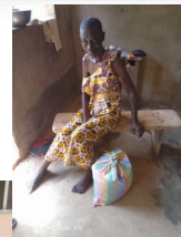
Three Trokosi widows & blind also received