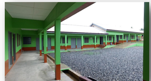
Seeway Academy school