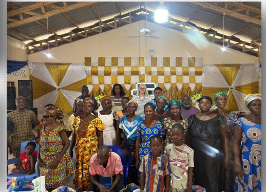
Widows and disabled in Kuli from several churches