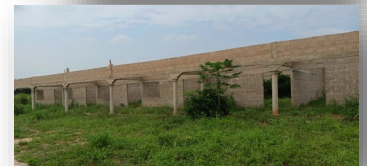
Director's Bungalow (left)