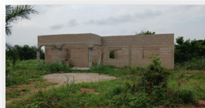
(Bottom right and left)